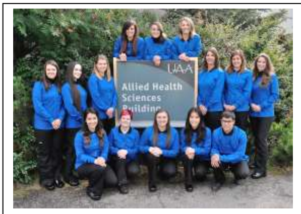
UAA Dental Hygiene Class of 2018

We are preparing for our joint CE with CIDHA on April 13. Both classes are preparing posters for their table clinics. Last year was a great experience for the students to interact with professional hygienists, and this year should be just as good. We are so fortunate to be part of the Alaska State Dental Hygienists' Association and to be able to connect with the amazing professionals that belong to it. Thank you all for your support of our students and program.